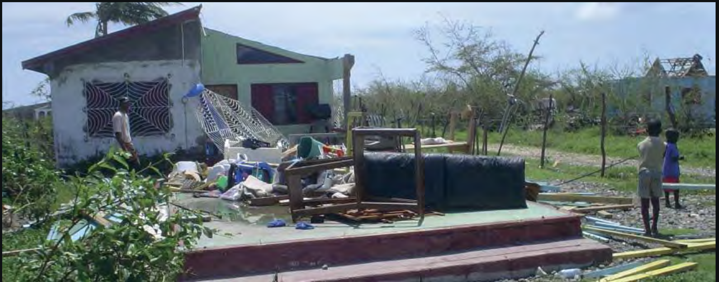
Plate 2.2.3 Damage resulting from Hurricane Ivan, Portland Cottage, Clarendon (Water Resources Authority, 2004)