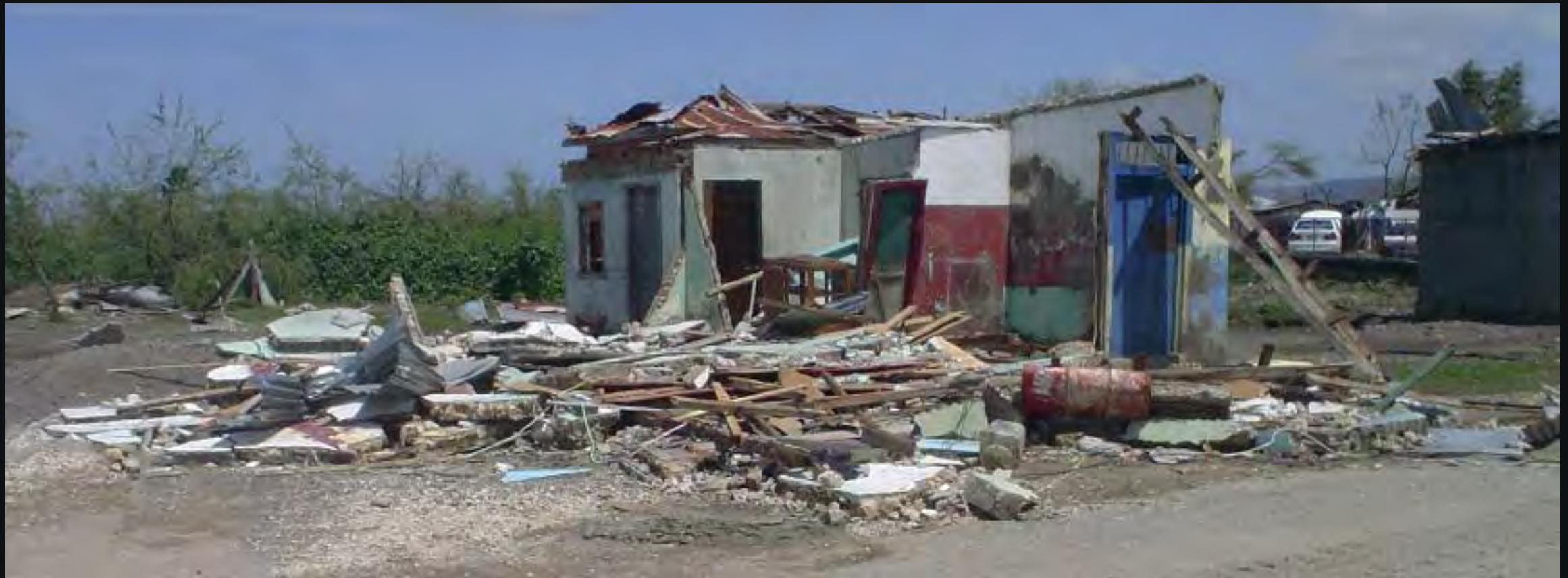
Plate 2.2.2 Damage resulting from Hurricane Ivan, Portland Cottage, Clarendon (Water Resources Authority, 2004)